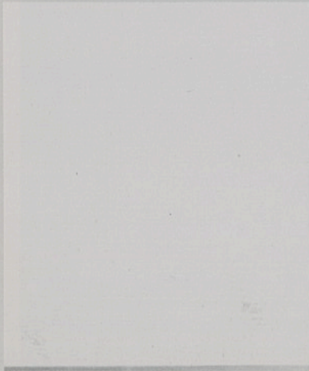
The photo of the sky over the sea