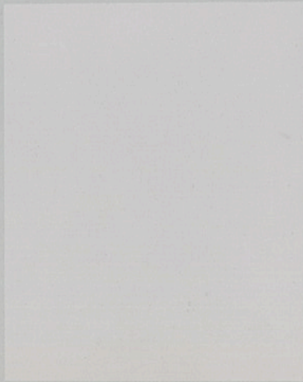
The photo of an envelop